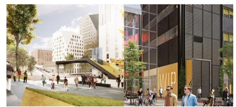
The proposed scheme