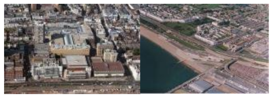
The Brighton Centre and Churchill Square